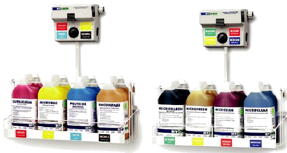
KITCHEN CLICK A MIX DISPENSER