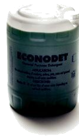
ECONODET / POT WASH DETERGENT