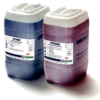
HYWASH AND HYDRY DISHMACHINE DETERGENT AND DISHMACHINE RINSE AID